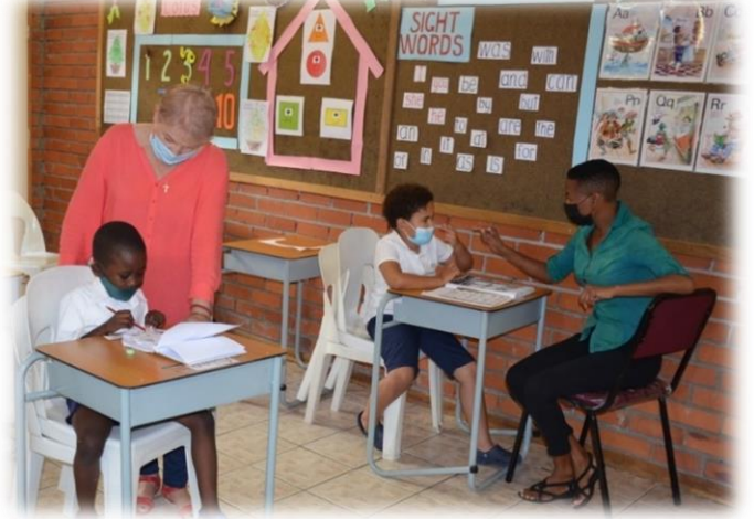
EXAMPLES OF LOTUS CLASS ACTIVITIES