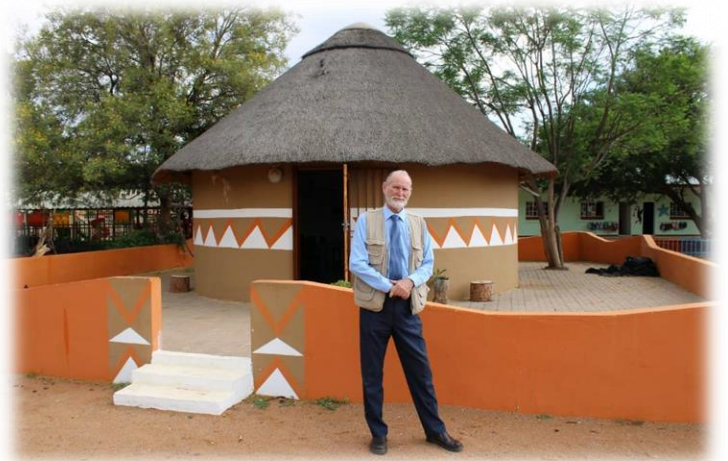
LEARNING SUPPORT CLASSROOM/OFFICE OF HEAD OF DEPARTMENT